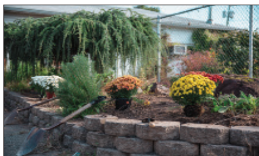
Students designed, built, and planted three raised beds and constructed paved walkways for the Shaping a Green Bergen Coalition teaching and kitchen gardens.

Students in the Environmental Design program gain experience and knowledge in plant materials, deciduous plants, trees, ornamentals, shrubs, evergreen plants, and ground coverings. Moving from classroom instruction to practical applications, students learn how to place, plant, and maintain turfs, shrubs, and plantings for beautification of homes, businesses, and community areas. BCTHS/Paramus is proud to partner with Bergen Community College to offer our students the ability to gain six credits at no cost prior to graduation. This partnership exists due to the fact that our program goes far beyond simply basic mechanics of landscaping